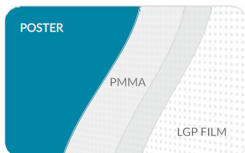
Cross-section of the backlight unit